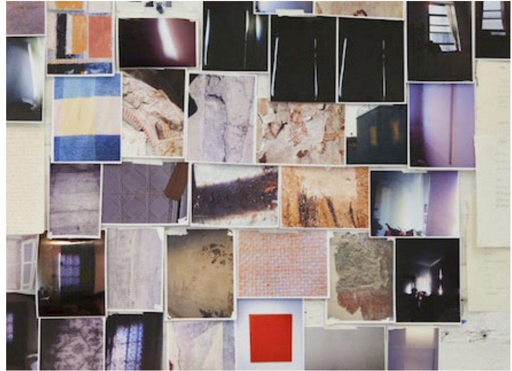
Photographs on Dickinson's studio wall.

Rail: The new book of your work features the eight paintings made between 2012 and 2013, each followed by its complete set of "remainders" (full-scale graphite rubbings documenting significant shifts in the paintings as they're made). And in your interview with Patricia Treib, included in the book, you said you were imagining the paintings from your show Before/Beside (2011), emitting light, then casting shadows, and the next body of work being conceived of as those shadows. I loved the idea of the shadows becoming physical objects. I thought that was a poetic way to connect the two bodies of work and it speaks to your interest in light and time as subject matter. Is the work in your current show a con-