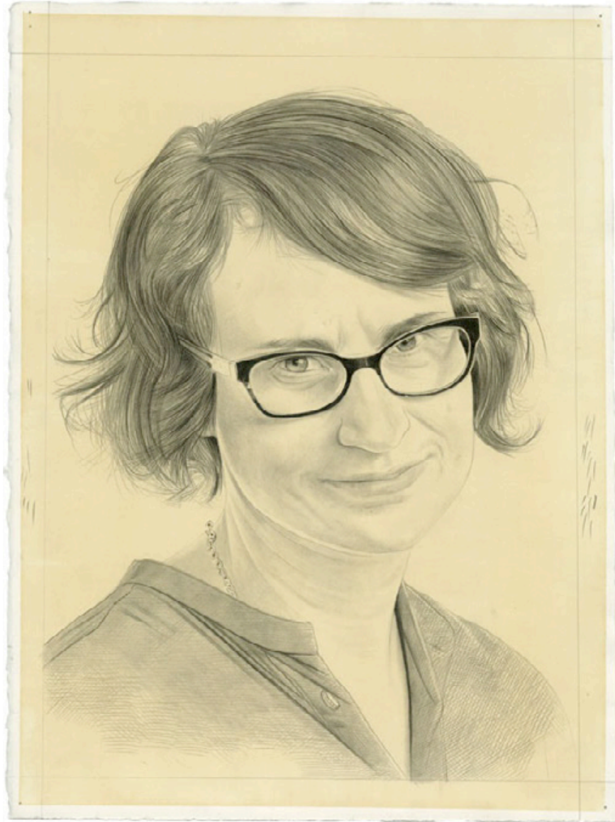
Portrait of the artist. Pencil on paper by Phong Bui.