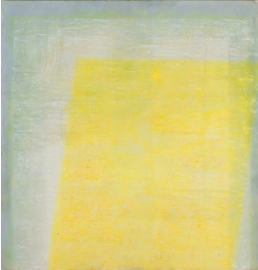
HERE, 2008-2009, oil on limestone polymer on wood panel, 56 × 53 inches, courtesy the artist and James Fuentes LLC, New York.